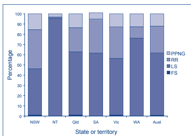
Figure 1. Penicillin resistance of gonococcal isolates, Australia, 2007, by state or territory

(chromosomally mediated resistance to penicillin – CMRP). Chromosomal resistance is defined by an MIC to penicillin of 1 mg/L or more. 1,6 (The minimal inhibitory concentration in mg/L (MIC) is the least amount of antibiotic which inhibits in vitro growth under defined conditions.) Infections with gonococci classified as fully sensitive (FS, MIC \leq 0.03 mg/L), less sensitive (LS, MIC 0.06–0.5 mg/L) would be expected to respond to standard penicillin treatments, although response to treatment may vary at different anatomical sites.